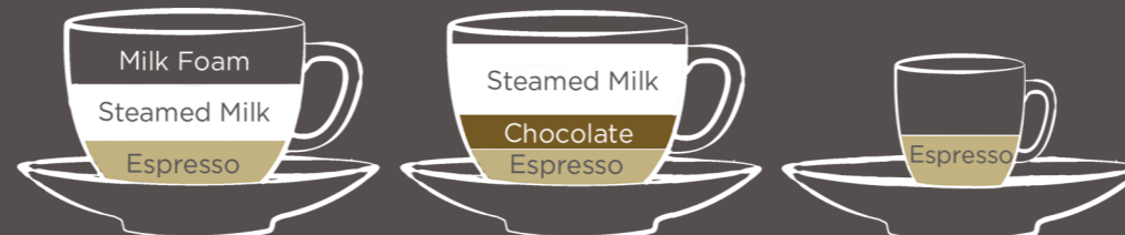
Cappuccino Mocha Espresso