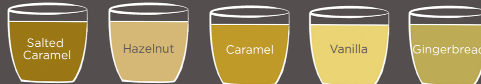
Syrup Shots 60p