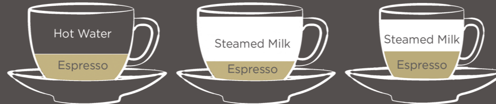
Americano Latte Flat White