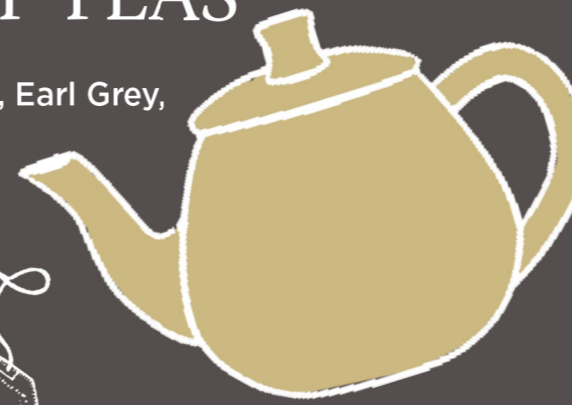
The Mill all day Tea £2.50